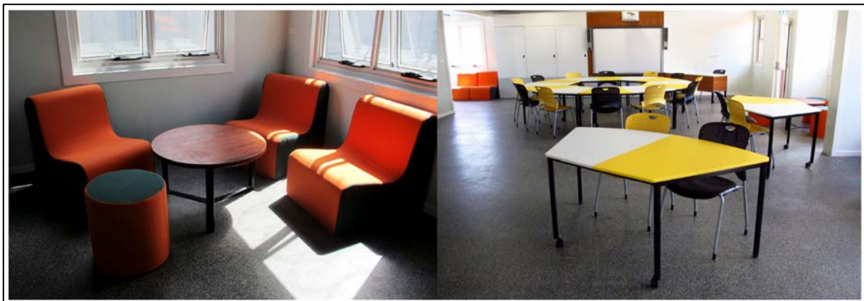
Figure 3, left and right: The inside learning areas of the ILC offer opportunities to interact with people at different scales in productive, meaningful ways. (2013, Mid North Coast Correctional Centre, Kempsey, NSW)

As the images show (see below and Appendix A), this was then applied to the design at different scales (e.g. the furniture, floor plans and site plans), offering opportunities to interact with different scales of community in productive, meaningful ways.