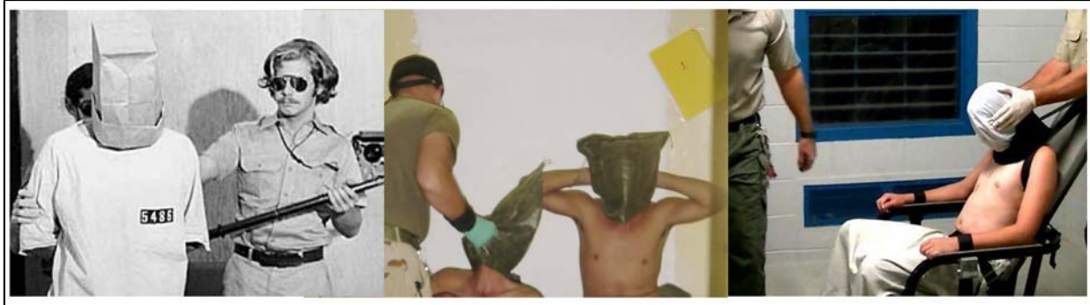
Figure 3, left to right: Stanford Prison experiment, USA, 1973; Abu Ghraib Prison, Iraq, 2003; Don Dale Youth Detention Centre, Northern Territory, 2015

The Stanford prison experiment and related research provides some important learnings for understanding the current NT detention system. First, and most critical, is the power of institutions and environments to create a situational context that can elicit staff to engage in extremely punitive behaviour, and detainees to experience extreme helplessness and agitation.