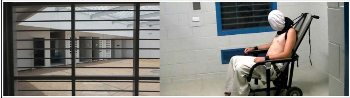
Figure 1: The refurbished behavior management unit and a young person alone in a restraining chair at the Don Dale Youth Detention Centre