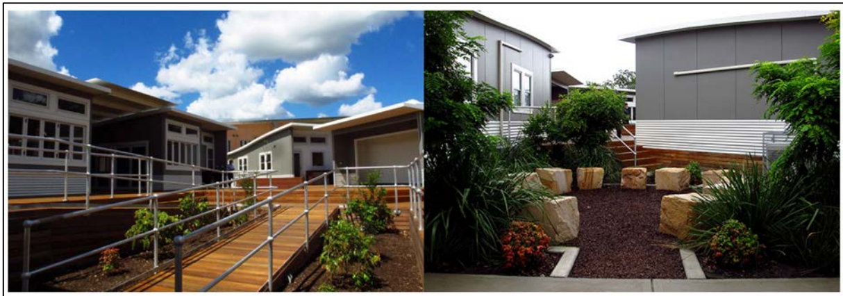
Figure 1, left and right: The grounds of the Intensive Learning Centre (ILC). Outside learning areas were designed to support learners to engage in social “rituals” (2013, Mid North Coast Correctional Centre, Kempsey, NSW)

We can look to an example from DOC where this approach is proving to be effective – the design of the previously mentioned ILC at the Mid North Coast Correctional Centre, a medium security prison.