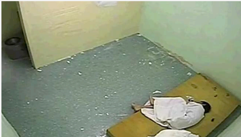
Figure 2: The electronic eye becomes our gaze.

The brutally bleak and sparse environment is the silent backdrop to the behaviour of the young people and staff. Whilst community opinion varies widely with regard to the level of quality that prison environments should be afforded for the incarcerated, the environmental conditions of the Don Dale footage would have satisfied the bleakest of opinions. It was dire at best. The at-risk spaces appeared less than human and resulted in a parallel behaviour playing out on our screens. This is what we see and this is Don Dale's connection with community.