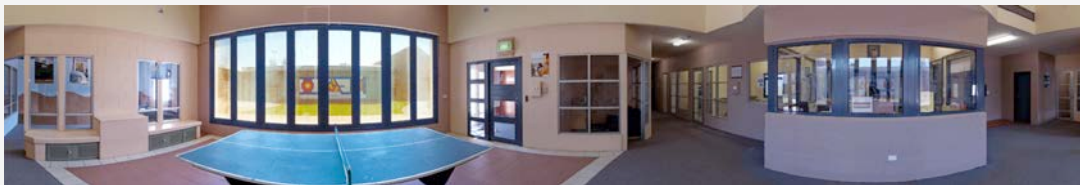
Figure 4: Images of the three residential units from actual juvenile detention facilities used in the research.

The impacts on staff participants' impressions were similar, but there were some differences. The impressions of staff participants for 'other staff' and 'themselves' in the Institutional, High Security Living Unit differed substantially in terms of hardness ('very hard' versus 'neither hard or soft'), but didn't differ in terms of goodness. No matter the setting, staff participants' impressions of 'other staff' and 'themselves' were 'good'. In comparison, detainees viewed 'other detainees' and 'themselves' as a lot worse in the Institutional, High Security Living Unit.